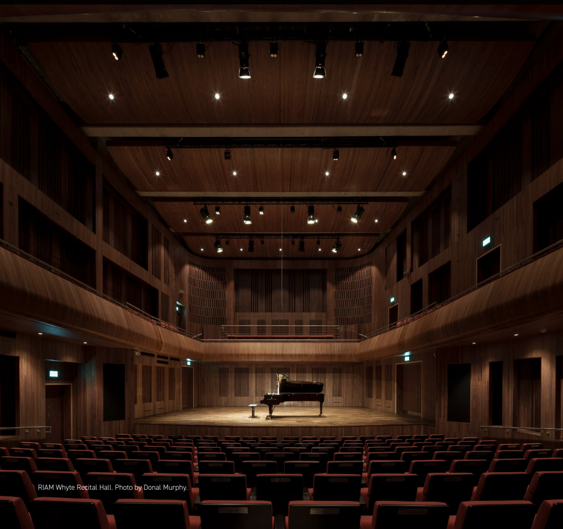
RIAM Whyte Recital Hall.

If you are a taxpayer in the UK or the US you can designate your gift to RIAM through our partnership with The Ireland Funds Great Britain or The Ireland Funds America and avail of the relevant tax deductible advantages in those jurisdictions.